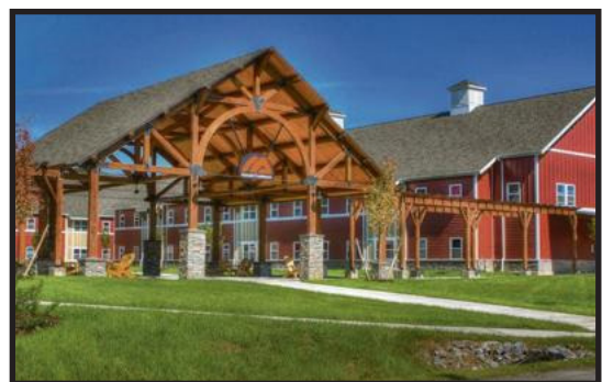
Alumni Commons where we will be staying

We look forward to welcoming you to SUNY Cobleskill!