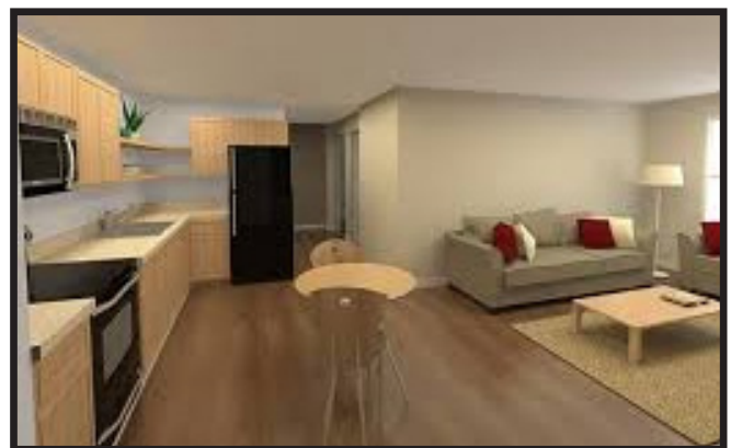
Sample of dorm suite common area

I have found it very rewarding to work with the rest of the Executive Council. It has also been a pleasure working with all the Conference Committee members over the past years. Please considering running for an office or joining one of the many committees of our organization. Let's continue to make NYSLAA successful in the future.