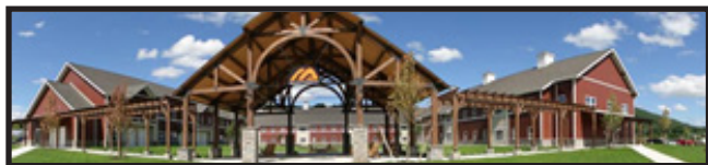
Lodging is on campus at the Alumni Commons

Our 42nd conference will be taking place June 10-12, 2020 at the State University of New York College of Agriculture and Technology in Cobleskill, NY.