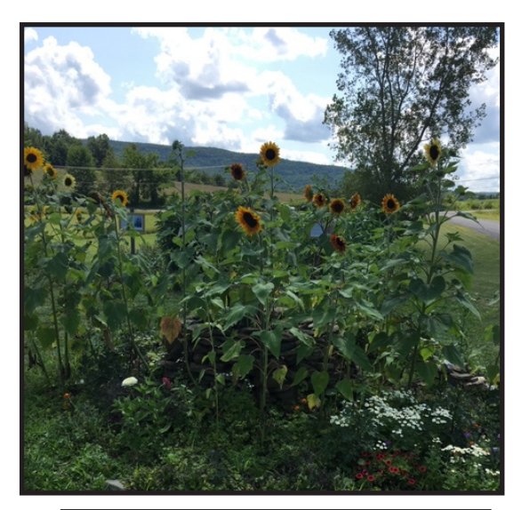
Beautiful mountains and coutryside surrounds Cobleskill, NY

Please watch the upcoming newsletters, Facebook and the NYSLAA listserv for more details as we get everything fine-tuned for you. We expect to pull together another great conference. See you next year!