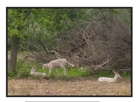
White deer seen on our tour