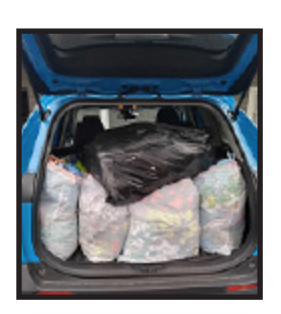
Project Linus blankets packed and ready to be delivered

Project Linus blankets made by our members