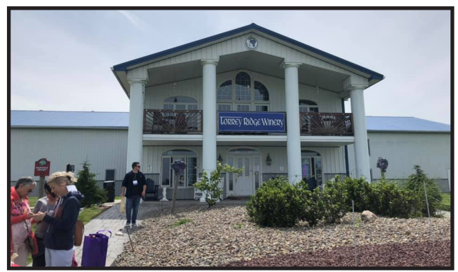
Tour group at Torrey Ridge Winery