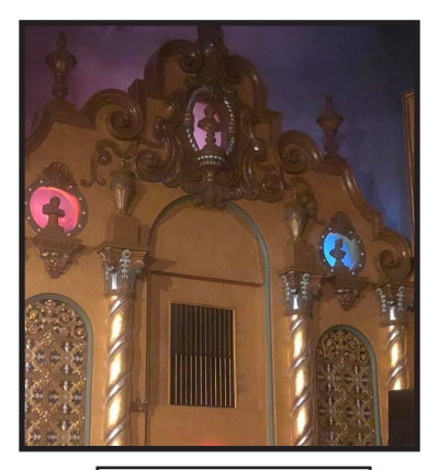
Interior of Smith Opera House