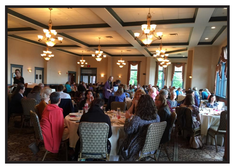
Thursday dinner at Belhurst Castle

August 17, 2018 - Chicken BBQ Dinner November 17, 2018 - Ham Dinner December 28, 2018 - Chicken Parmigiana Dinner February 25, 2019 - Meatloaf Dinner