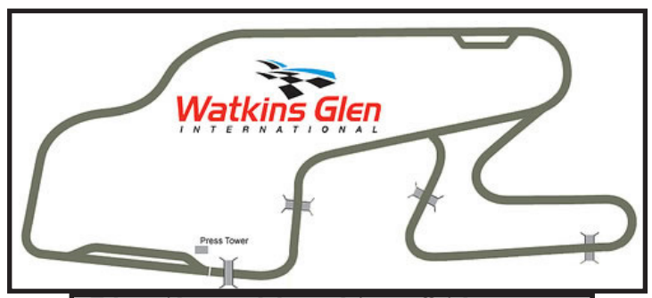
Take a ride around the track in an official pace car at the Thursday night event for $10. See registration form.

I can't believe I am entering my 6th year of being Vice President of NYSLAA. I have attended all Executive Council meetings during 2017. I maintain the archives by filing minutes and all other association documents. I post updates for NYSLAA on their Facebook page as well. The Certificate of Achievement Review Board is another way in which I support library assistants. If you haven't received your Library Assistant Certificate of Achievement please contact me and I will point you in the right direction. I have found it very rewarding to work with the rest of the Executive Council. Please consider running for an office or one of the many committees of our great organization. Let's continue to make NYSLAA successful in the future.