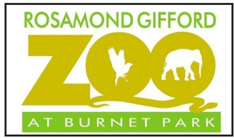
Thursday evening conference dinner location.

Please consider getting involved with NYSLAA whether it be as an officer or on a committee. We are always looking for new members and more of you to volunteer. NYSLAA is such a worthwhile organization.