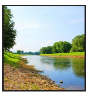
The Beautiful Chemung River

Come join me this beautiful autumn season at the "place of the horns," as the Algonquin Native Americans called it. I am speaking of course about Chemung County, so named for the Chemung River where the native