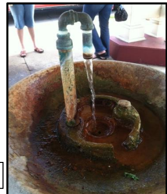
Old Red Spring in Saratoga Springs