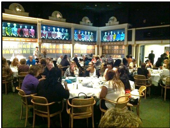
Dinner in the Hall of Fame, National Museum of Racing and Hall of Fame