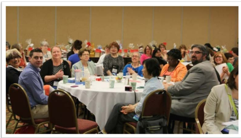
The NYSLAA Conference always makes us smile