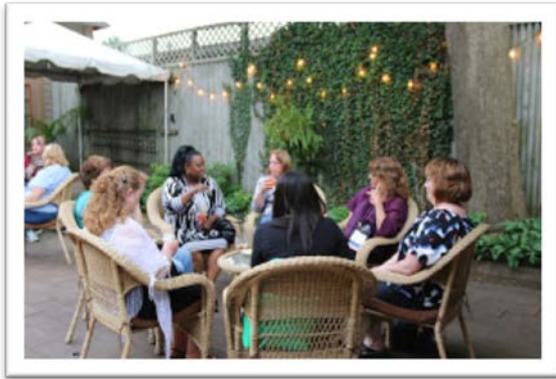
Mixer – Inn at Saratoga

Library Assistants: Racing Forward with Technology, the 36 th Annual Conference was absolutely amazing. The venue, Holiday Inn of Saratoga Springs could not have been more attentive to our needs.