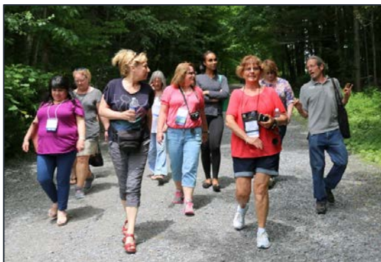
Roosevelt Baths and Spa Tour