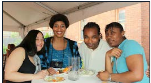
Hanging out and catching up with friends!