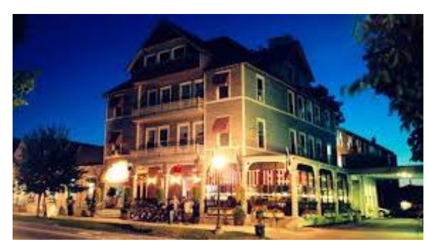
The Inn at Saratoga (Our mixer will be held here in June.)