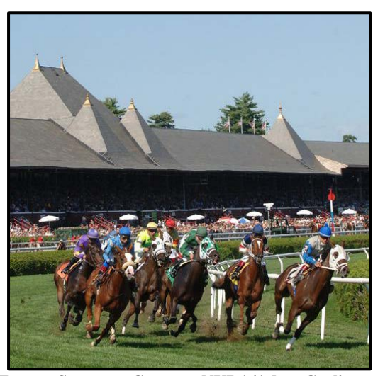
Turn at Saratoga.

The 36<sup>th</sup> Annual NYSLAA Conference, Racing Forward with Technology will take place June 4-6, 2014, at the Holiday Inn in Saratoga Springs, NY.