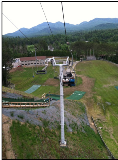
Riding the Chair Lift at The Olympic Center