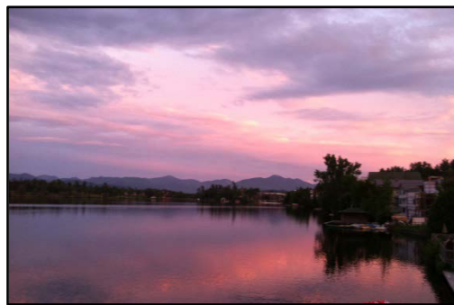
Sunset over Mirror Lake, Lake Placid, NY