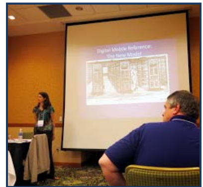
Workshops at the 2013 NYSLAA Conference