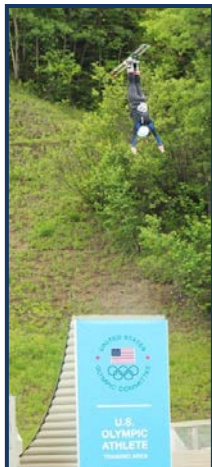
Jumping at the Olympic Center

Level IV-Public Services Level III-Public Services Level IV-Public Services Level IV-Technical Services Level IV-Admin./Management Level IV-Public Services Level IV-Automation Level IV-Public Services Level IV-Public Services Level IV-Automation Level IV-Automation Level IV-Public Services Level IV-Gen. Library Services Level IV-Admin./Management Level IV-Public Services Level III-Public Services