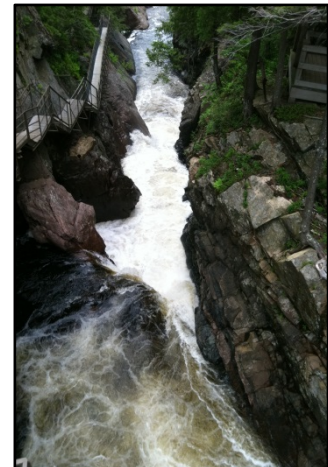
High Falls Gorge