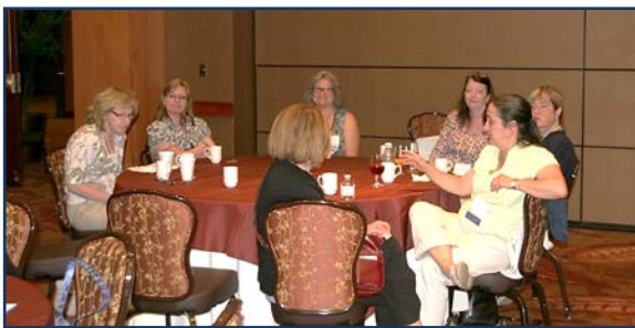
Deep discussions at the 2012 conference!

Respectfully submitted, Coleen L. Hopkins