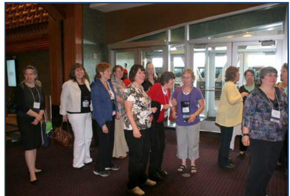
(2012 Attendees gathering in the lobby)