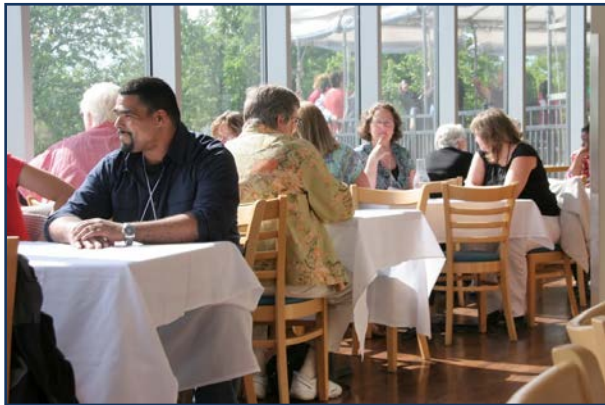
(2012 Thursday dinner at the Top of the Falls)