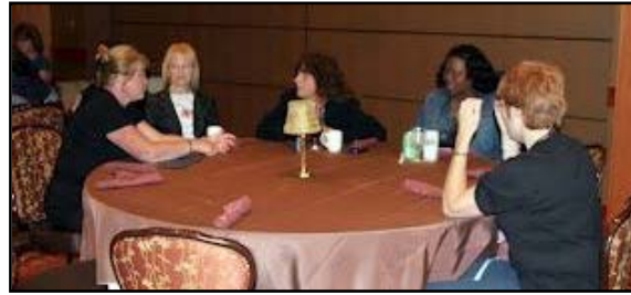
Niagara Falls conference networking.