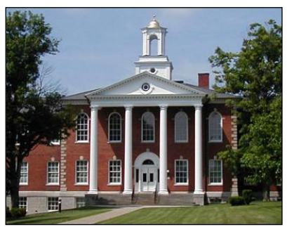
Livingston County Courthouse