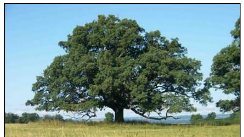
The Valley Oak