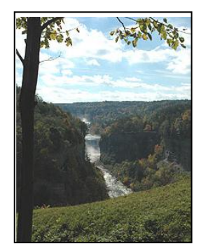
Letchworth State Park. Just a few miles from Geneseo.