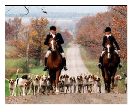
Geneseo Hunt - one of the oldest in the country.