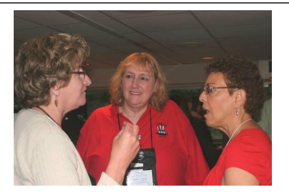
OK, what are they up to now??? 2009 Conference