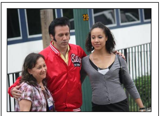
Their FIRST conference and ELVIS, too! At the Captain JP, 2009 Conference