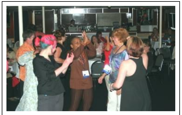
Dancing onboard the Captain JP 2009 Conference

As always, if you have a question regarding your membership or if you need a letter verifying your years of NYSLAA membership for the Certificate of Achievement Program please let me know.