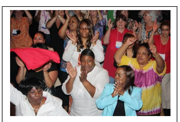
Some dance, some hide. Aboard the Captain JP, 2009 Conference