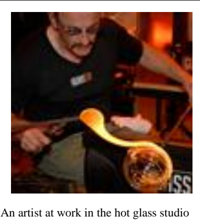
at the Corning Museum of Glass.

The NYSLAA 32<sup>nd</sup> Annual Conference will be held in Corning, NY, June 9-11, 2010. The Conference location will be the Radisson Hotel in Corning and there will also be events at the Corning Museum of Glass. Corning is located in the beautiful Finger Lakes and has a lovely historic business district. Start making your plans to join us!