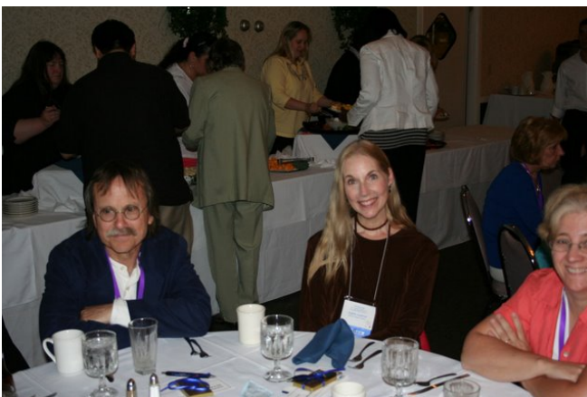
Thursday Night Dinner at Borio's