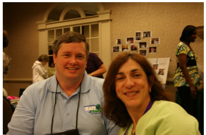
Enjoying the Conference

Join us for a terrific time this year in Troy! June 10 – 12, 2009