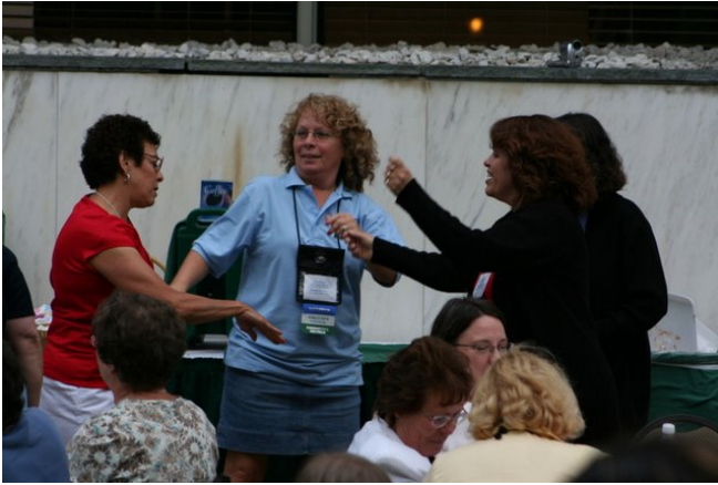
Dancing at the Mixer