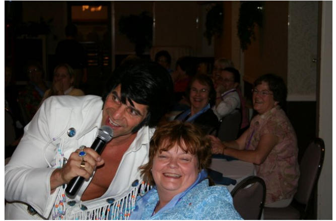
Being "Entertained" at Borio's