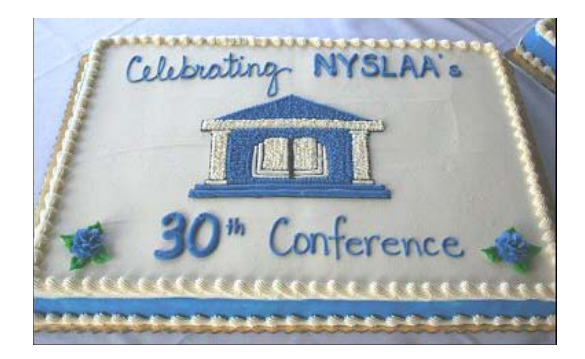
to the Conference Planning Committee for a very successful conference, and I extend my heartfelt gratitude for their enabling us to happily learn and socialize with each other once again.

This year's conference was our 30<sup>th</sup>! The coming together of so many members of our library community was indeed a wonderful celebration of our Association. Congratulations