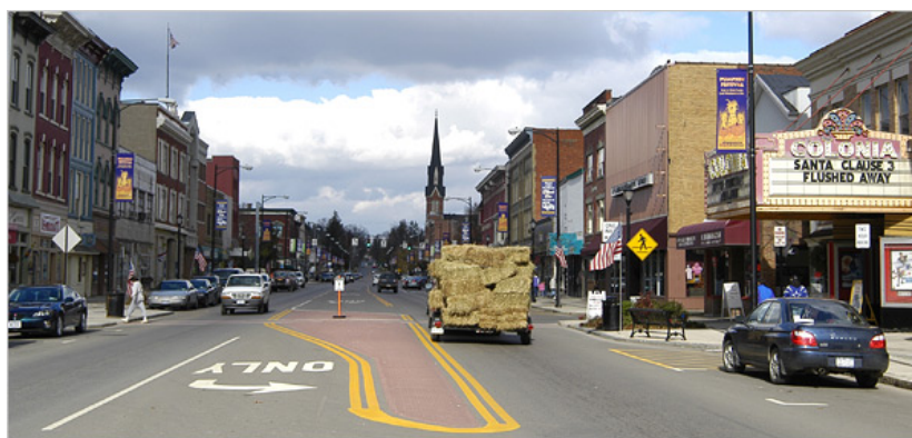
Norwich, NY from South Broad St. facing north.